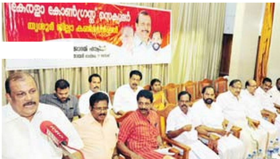
P C George addressing the gathering during the Kerala Congress (Secular) meet in Thrissur on Sunday.

KOCHI: Kerala Congress (Secular) leader P C George announced his decision to hold a one-day fast at the Rubber Board headquarters in Kottayam on December 28, in protest against the anti-farmer policies of the State Government and the Centre.